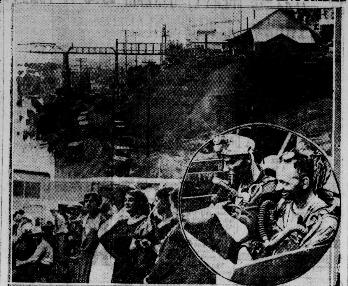
Above: A view of the building and wrecking equipment of the Argonaut gold mine at Jackson, Cal., where forty-seven miners have been entombed over three weeks. A fire that started in the mine shaft resulted in the miners, who were working some 4500 feet below, being buried alive. Below, left: Wives and families of the entombed miners waiting hopefully for word from the rescue workers striving to reach the buried miners. Below, right: Rescuers in car equipped with gas masks and oxygen tanks about to descend the main shaft to aid in the rescue work.